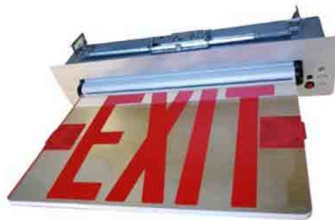
MRSEL Big steel box with hanger bar