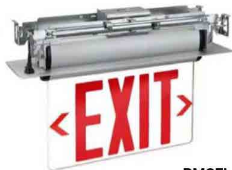
RMSEL J-box with hanger bar